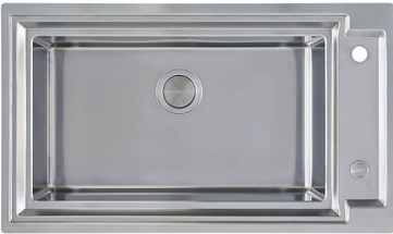
OUTLINE 6602 000